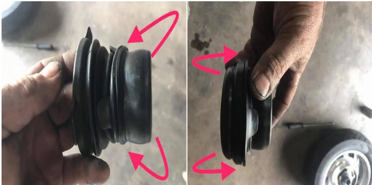
(left) Take the rubber boot and roll the small end of the boot back over itself like a sock.