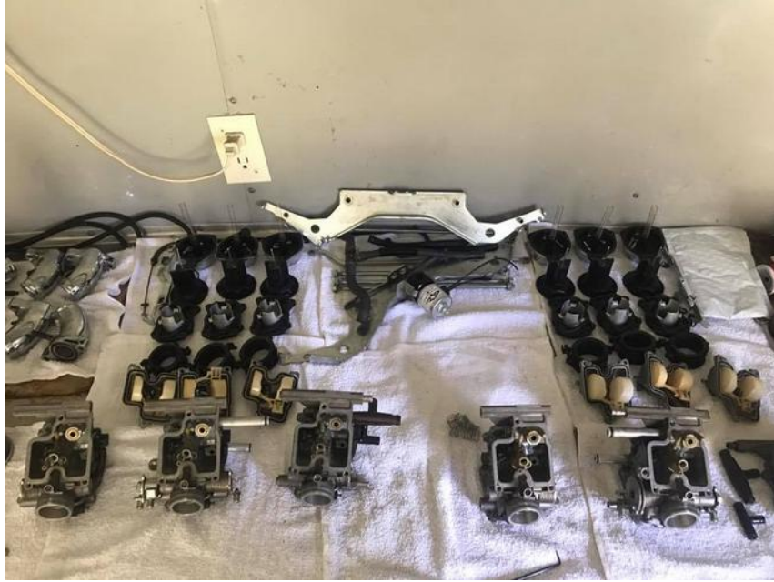
Our pile of parts is growing