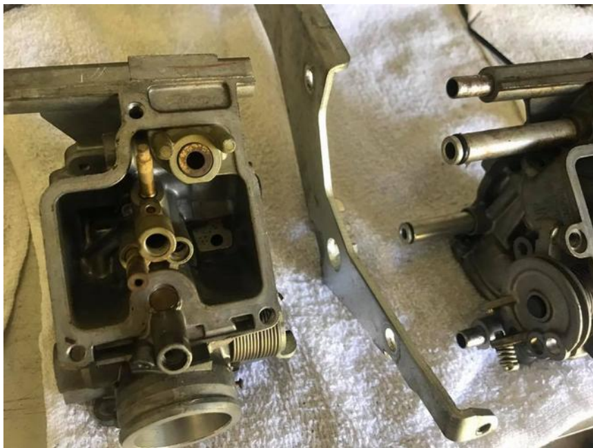
Where the bar that holds the banks together comes between the carbs it has metal rails with o rings