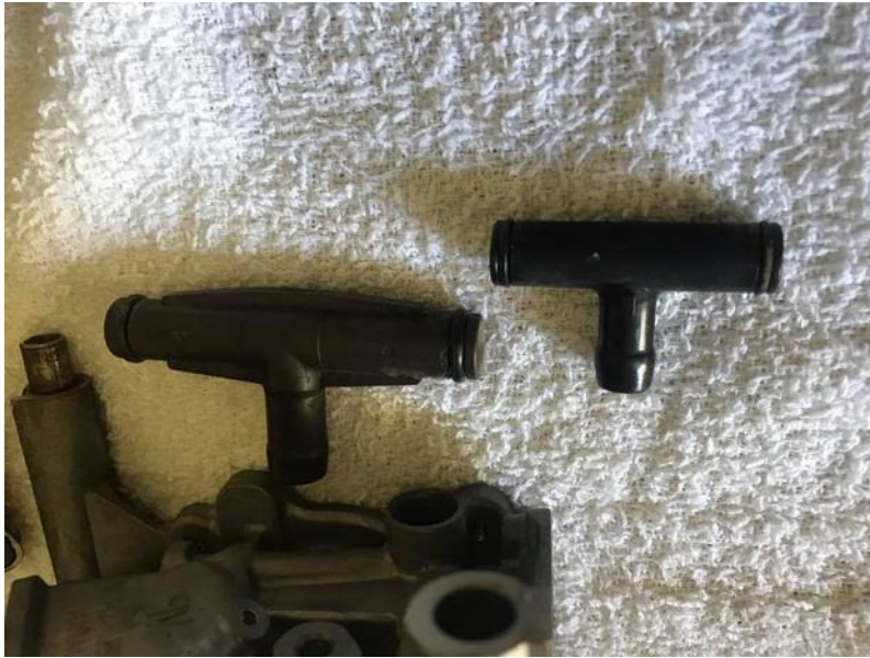
Fuel rail on the left Vent or overflow on the right. All the o rings we will replace with new