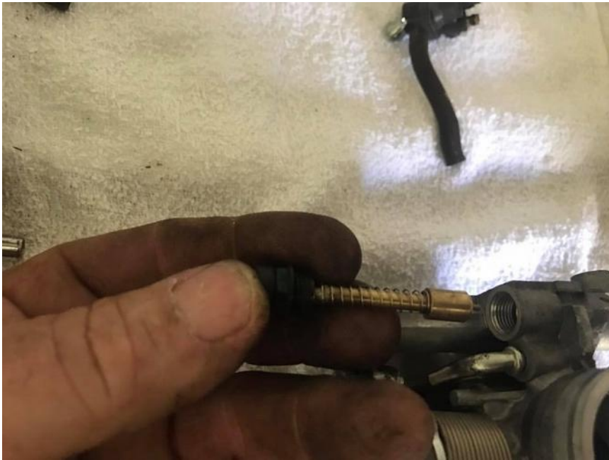
Pull the valve and spring out of the hole