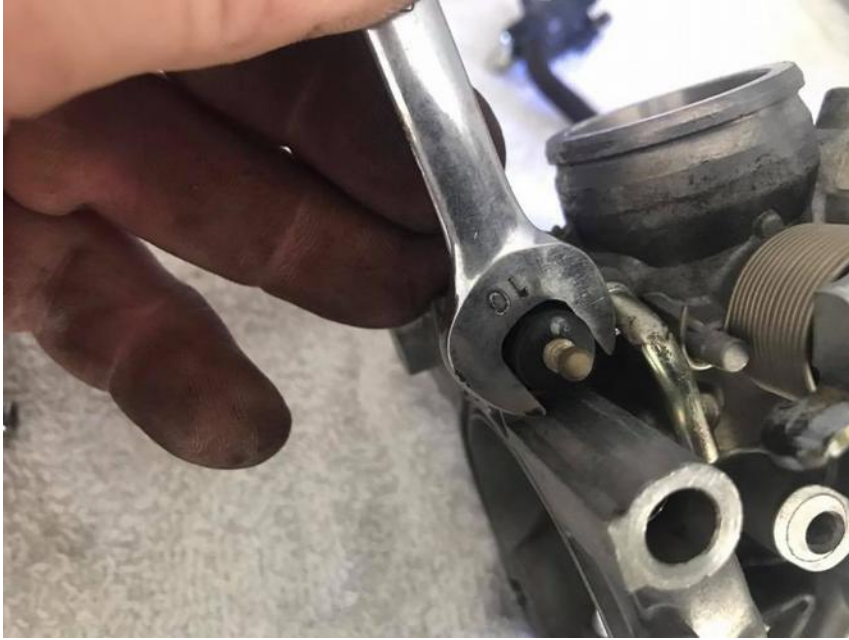
Counter clockwise and remove the enrichment valves